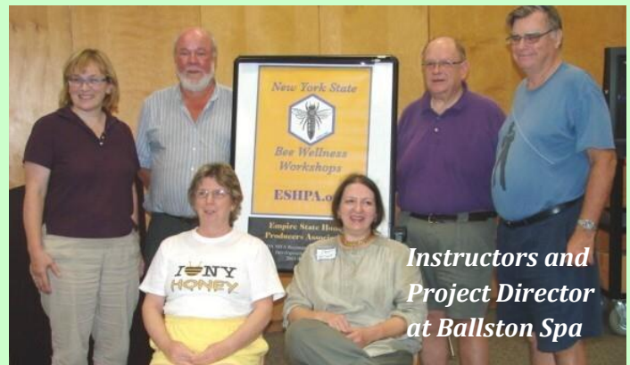
Instructors and Project Director at Ballston Spa