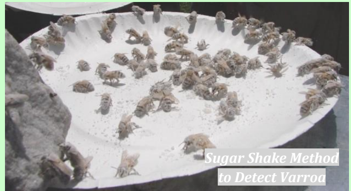
Sugar Shake Method to Detect Varroa

On November 17, there will be a Saturday morning workshop during the ESHPA annual meeting, featuring some of the best of the workshop: Microscopy, frame diagnosis (What's Wrong with this Frame?), and American Foul Brood identification.