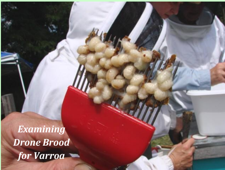
Examining Drone Brood for Varroa