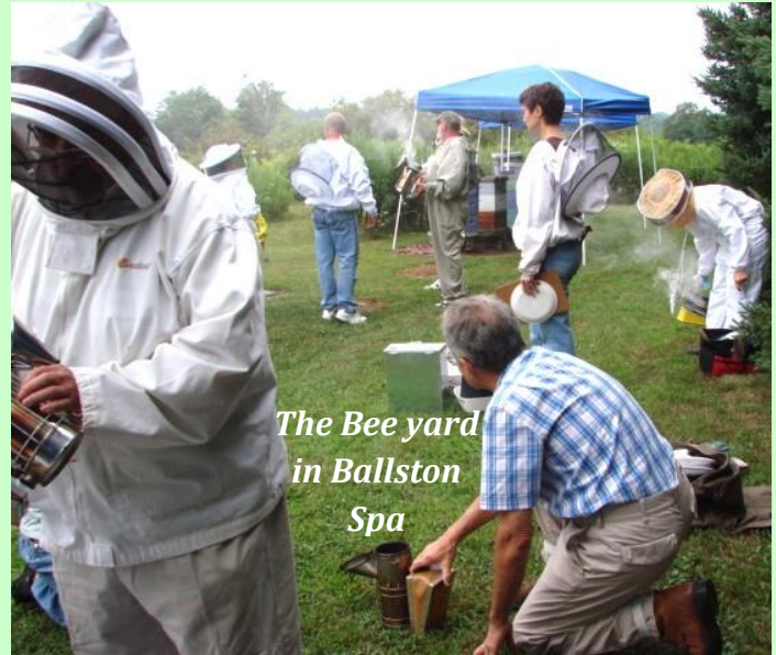
The Bee yard in Ballston Spa

While this was the first year of the 3 year project, some see this program as a beginning to a permanent outreach training program for New York State beekeepers.