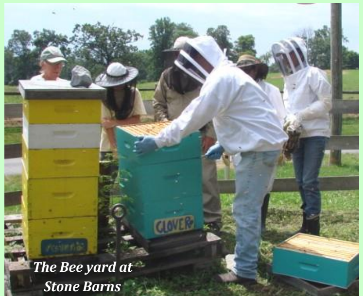
The Bee yard at Stone Barns