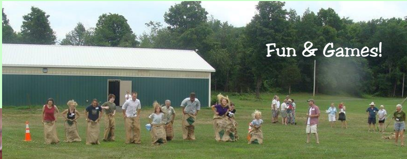
Fun & Games!

A beautiful day, great company, fantastic food, and an excellent speaker made for a memorable summer picnic meeting!