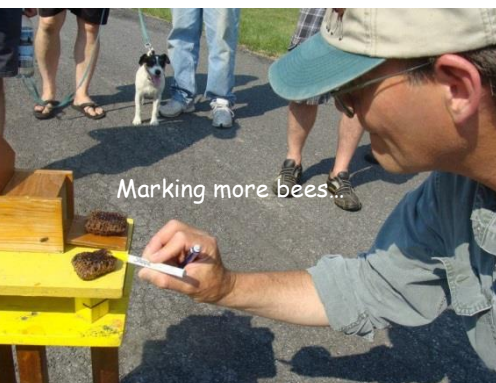
Marking more bees...

zeroed in on what seemed to be a nearby prize. Dividing the round trip time by the average speed of honey bee flight gave an idea of how close the colony might be. With an idea of distance and direction, we moved the station once and repeated. No marking or timing at the second