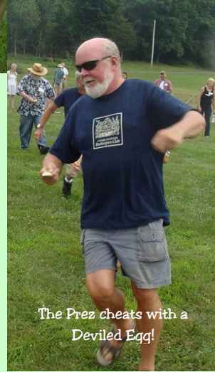
The Prez cheats with a Deviled Egg!

For me, the high point of the meeting came at the business meeting. Yes, the business meeting! Guests from The Discovery Center of the Southern Tier presented their proposal for an upcoming exhibit, "What's the Buzz - A Honey of an Exhibit". After the presentation a motion was passed to donate $1000 to support their efforts. I received a very nice "Thank You" letter from the Discovery Center. "We truly appreciate your donation and look