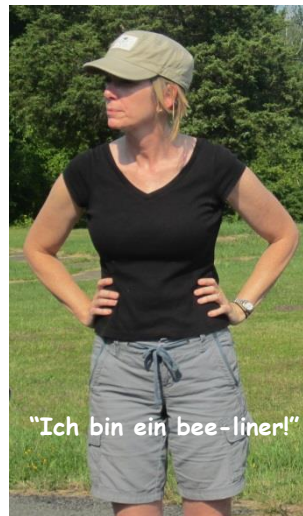
"Ich bin ein bee-liner!"

used to be bees there. But a bear tore the back of the barn off and there ain't no bees there anymore!"