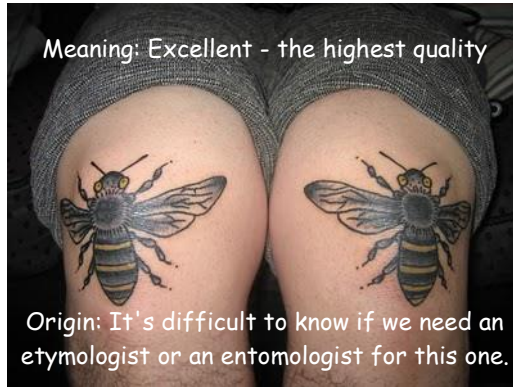
Meaning: Excellent - the highest quality