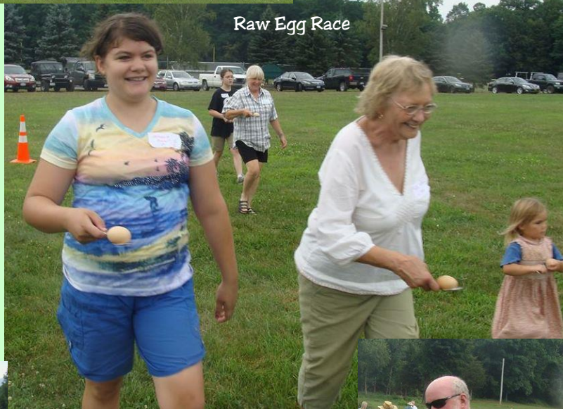
Raw Egg Race