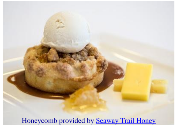
Honeycomb provided by Seaway Trail Honey

We thank Senator Schumer for supporting New York honey!