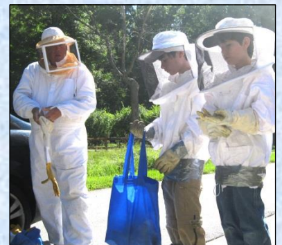
First time beekeepers suiting up!

The Stony Kill Farm Apiary Group is a volunteer Apiary Group located on about 1000 acres of land once belonging to the Vanwyck Family in Dutchess County, New York and now attended by a not for profit entity with education and preservation as its main goals. The Apiary Group began with 2 persons in April of 2012 and has grown to around 50 adults since beginning monthly lectures, presentations, shop work, field work, mentoring programs and community outreach programs. We also actively teach young people in fourth, fifth and sixth grades about bees and other pollinators. One such group begins in January and continues weekly through May and is made up from young people from the five Boroughs of New York City as well as local youth. In conclusion, The Bees Are Alive and Well At Stony Kill Farm.