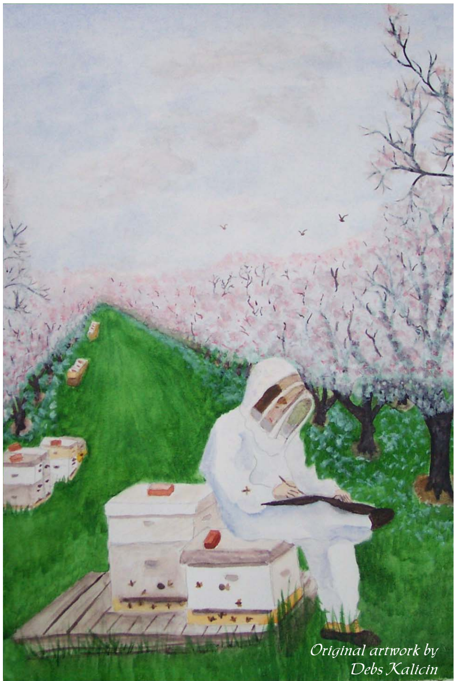
Original artwork by Debs Kalicin