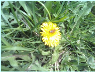
Spring At Last

In the North Country, as well as most of New York, this has been a prolonged cold winter and a cold wet spring. Hopefully the weather will warm up and the bees and everything will explode.